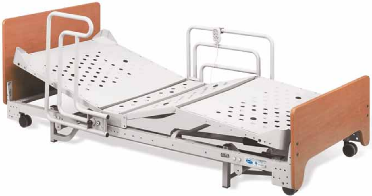
SHOWN WITH OPTIONAL PAN DECK

The SC900DLX is a full-function, full-feature, low-height bed that promotes quality resident care with full bed performance. Its three DC motors provide ultra-quiet operation of the head, hi-low and foot functions of the bed. Plus, the horizontal travel range of the SC900DLX is designed so that the bed will not damage walls during height adjustments.